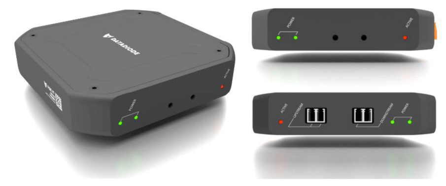
Figure 1: The TOE as a single hardware unit

The Target of Evaluation (TOE) consists of a single hardware unit, see figure 1. The TOE Fort Fox Hardware Data Diode is a unidirectional network and only allows data to flow in one direction. The one way physical connection of the TOE allows information to be transferred optically from one network (the upstream network) to another network (the downstream network). The unidirectionality of the data flow ensures the integrity of the upstream network against threats from the downstream network, and simultaneously ensures the confidentiality of the downstream network. To ensure signals can only pass in one direction, and not vice versa, the TOE deploys a single light source as the only connection to the downstream network. Fiber-optic cables are used to connect the TOE to both the upstream and downstream networks in order to minimize electromagnetic coupling. Physical restrictions on the environment ensure that the unidirectionality of the dataflow cannot be bypassed.